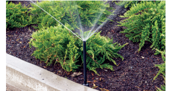
Limit plant watering to twice a week.

More Outdoor Tips click below www.savingwater.org/LawnGarden/index.htm