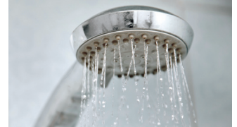
Reduce your showering time.

More Indoor Residential Tips click below www.savingwater.org/Indoors/index.htm