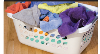
Wash only full loads of laundry and dishes.