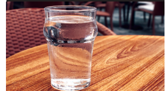
Serve water only on request.

More Indoor Business Tips click below www.savingwater.org/Businesses/index.htm