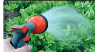
Water plants before 8am (best) or after 7pm.